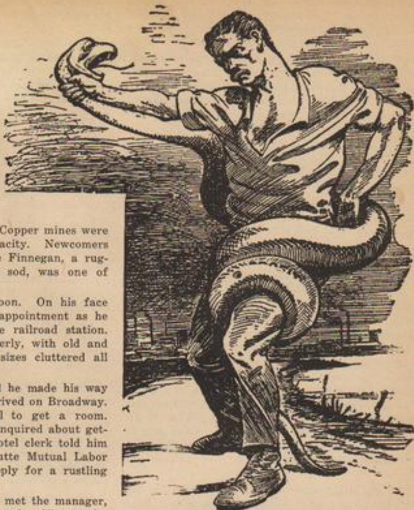
The "Anaconda" crushes a victim

It was in the spring of 1925. Copper mines were operating at their greatest capacity. Newcomers were pouring into Butte. Mike Finnegan, a rugged individualist from the old sod, was one of them.