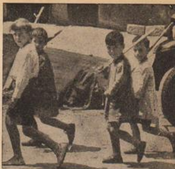
Children play at war in Barcelona

It is midafternoon. We are in a huddle reading a bulletin that has just been posted on the wall. It contains a list of the names of men who are to leave for Paris this evening. Discharges and repatriation papers are in the office ready for distribution. Some read the bulletin and dash down the corridor to the office. Those unable to run just shuffle. There's a brightness in their eyes as though they just gulped a bracing drink. Satisfied smiles stretch across their sun-parched faces. Monosyllables of joy snag in their throats. They're the lucky ones. They're going home.