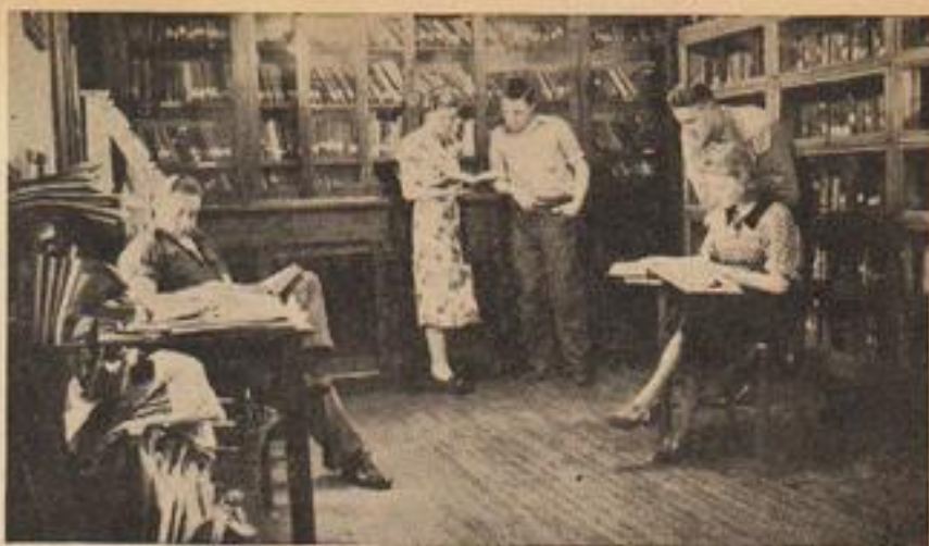
A corner in the school library—who says that co-education doesn't promote study?

failures. We are informed as to when and where the first strikes were pulled off and why they were or were not successful. Something is learned about those labor unions which were once in existence such as the Molly Maguires, the Knights of Labor, etc.; and something is learned about those labor unions still in existence such as the I.W.W., the A. F. L., the CIO, and others.