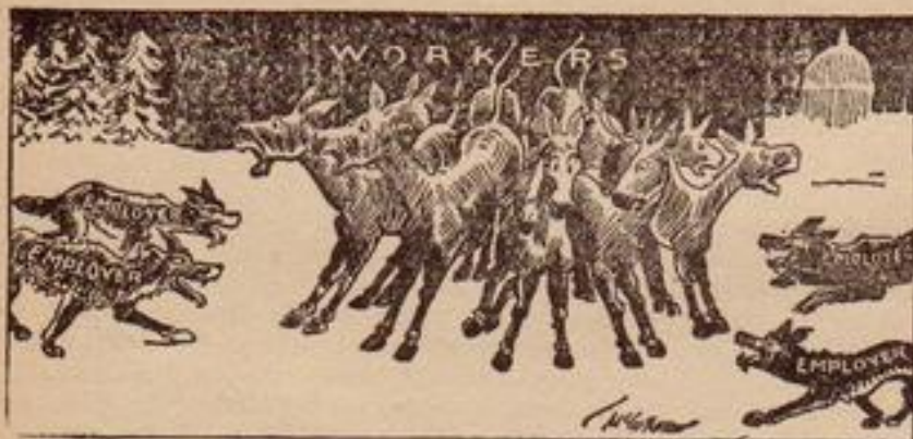
The Attack and