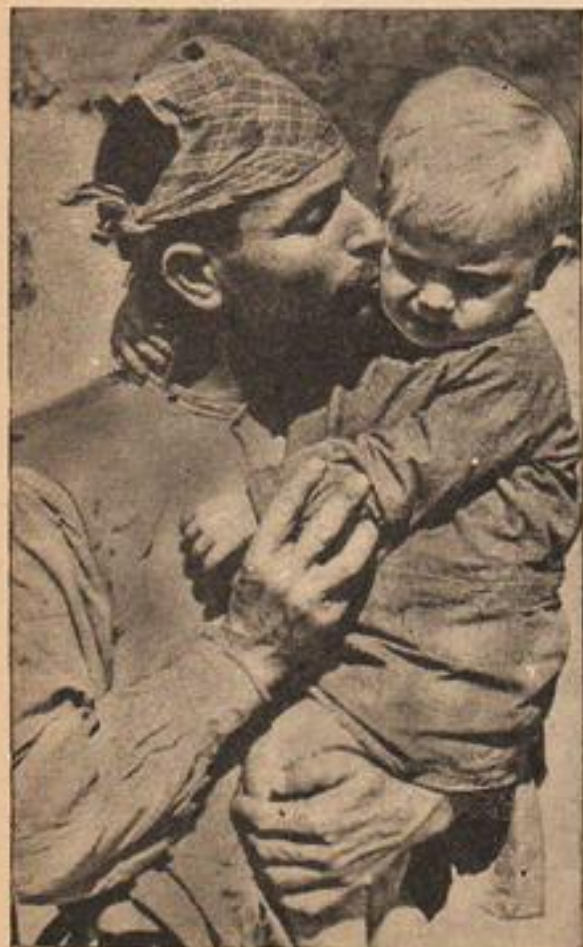
An Aragon farmer says farewell as he joins the Loyalist forces

The Canuck was a chauffeur in the ambulance corps. He says his job wasn't a snap, either, what with administering first aid before loading the wounded into the ambulance, and driving over the rough roads full of shell holes, unloading at