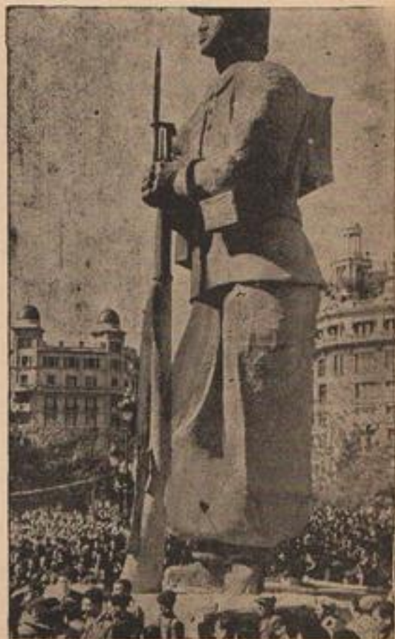
Plaster and lath statue of an anti-fascist fighter in a Barcelona square

Speaking of battle tactics, a Britisher has something to say about the fight at the Cordoba front. His voice is clear and his language faultless, and