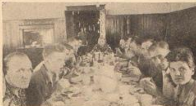
Caught in the act of inhaling porkchops—it took two large tables to accommodate the gang this year. The kitchen staff is 100 per cent organized in I. U. 640.

The Labor History class is the class in which the students learn how and under what conditions the first labor unions were formed and also of the political efforts of labor and their